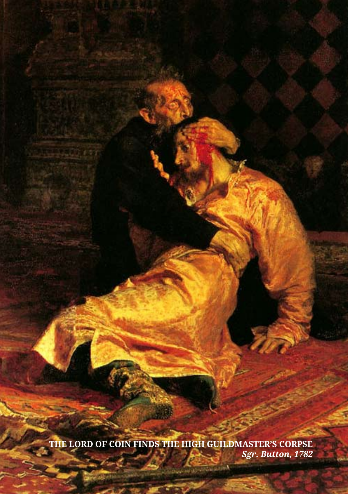
THE LORD OF COIN FINDS THE HIGH GUILDMASTER'S CORPSE Sgr. Button, 1782